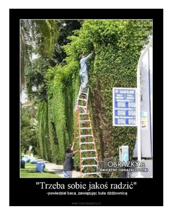
Figure 2. One should make do somehow, said a baca, tying his shoe with an earthworm

As Davies used to write and say, comic scripts are fictitious, but they emerge not without a social or historical reason (Davies 1990). The figure of a baca —admittedly somewhat self-contradictory—that emerges from the analysis of jokes performed for the present paper is the following: a strong, but lazy, promiscuous and sometimes dirty drunkard who likes to get things done his way without much effort, uses his vernacular language and perceives the world in an essentialist, often misleading, although doubtless creative way. This makes him a good example of the wise old man (also called senex , sage or Sophos) figure—typically seen as archetypical as described by Carl Jung or as classic literary figure, who can be a profound philosopher distinguished for sound judgment and is usually a stranger (the use of dialect will mark this feature). In the remaining part of the article the features which contribute to the image are discussed on the basis of relevant examples that we have selected from the collections of Polish highlander jokes as well as Internet sources (all listed in the references section).<sup>6</sup>