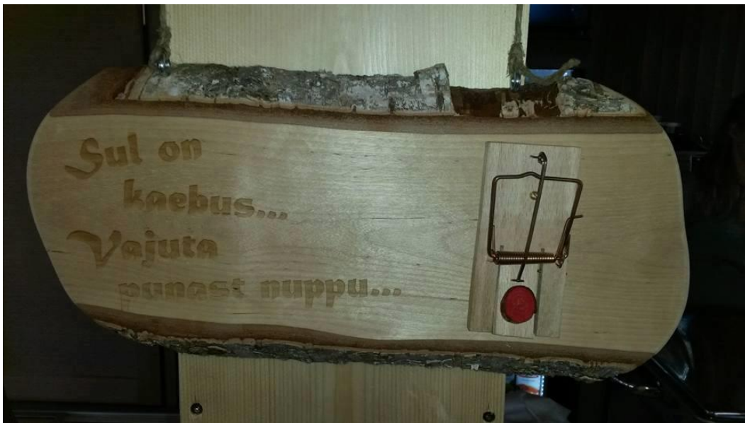
Figure 4. "You have a complaint... Press red button...".

in which they used humour. For example, the image in Figure 4 sends a clear message through humour that whining and complaints are not appreciated. However, some guests may not appreciate this message, as it implies that the hotel is not willing to deal with problems.