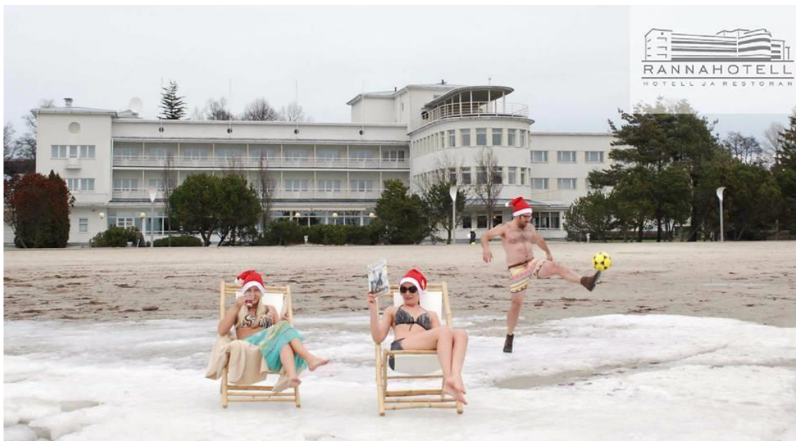
Figure 5. Beach hotel's Christmas card.

Another example was provided by a hotel with the highest quality service standards, which decided to send an amusing postcard to their regular customers and partners showing hotel workers relaxing on the beach covered with snow (see Figure 5). This humorous act of kindness gives the receivers of the postcard a possibility to reminisce about the enjoyable time they had during summer. It may also make them appreciate the hotel's employees, who are busy working for them while they enjoy the beach in summer, but can only take their holidays in the low season.