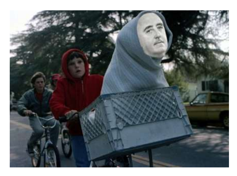
Figure 10. Proposals to remove Franco from the Valley.

children on the bike are taking Franco just like the famous alien, a teasing idea regarding the potential transport method to be used to take Franco discretely from the Valley of the Fallen to his new grave.