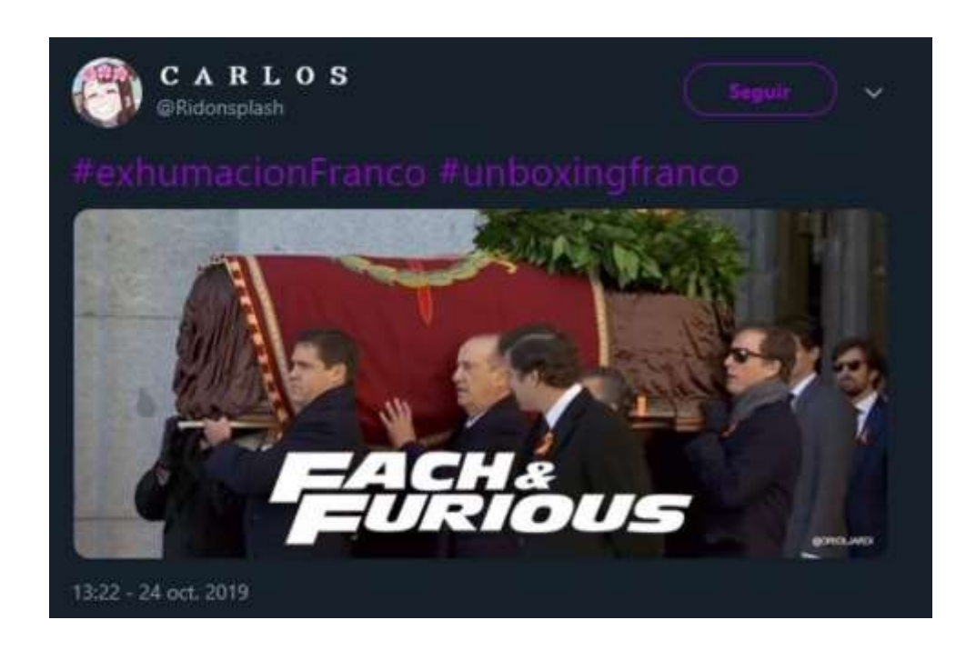
Figure 13. Departure of Franco's coffin carried by the relatives.

The ceremony was broadcast live on public TV, turning the coverage into the viewing of a historic event of great interest. The average audience of TV stations on the 24<sup>th</sup> of October was over seven million viewers and over seventy communication media from several countries asked RTVE to receive institutional signal to broadcast the event. Nevertheless, it was not only a TV audience success, but the whole media circuit also made up of social media reacted with activity, creating a "social audience" that gave their opinions on the programs, content, as well as government decisions regarding protocol and the funeral staging (Montemayor 2016). As a result of the media convergence and the interaction possibilities, there were transmedia narratives where different media and citizens told the same story but with a different language, including that of humour (Rueda & Moreno 2013).