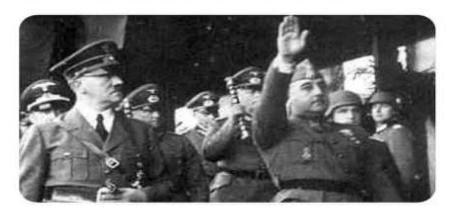
Figure 8. Questions about the destination of Franco's corpse.

One problem put forward was the process to be used to remove the gravestone located on the altar of the Basilica in the Valley of the Fallen. Moreover, the most appropriate transport method to be used was also debated when thinking about the transfer of the body to the new burial place, and those technical and ethical difficulties led to a lot of satirical creativity.