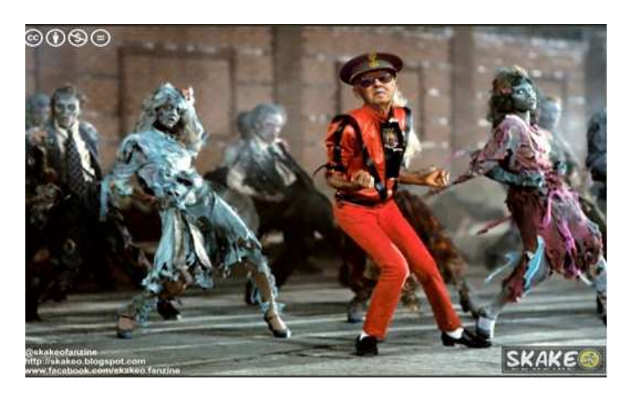
Figure 7. Thriller with Franco replacing Michael Jackson. Source: @skakeofanzine, October 22, 2019.

from the music video Thriller by Michael Jackson. In the choreography, made up of sinister and corpse-looking people, we can see Franco as just one more dancer in the group of zombies whose dance and music became a world hit. The dictator, therefore, is shown with a look that, far from being scary, invites people to follow the beat of the famous song. The time of uncertainty and fear caused by the character had come to an end.