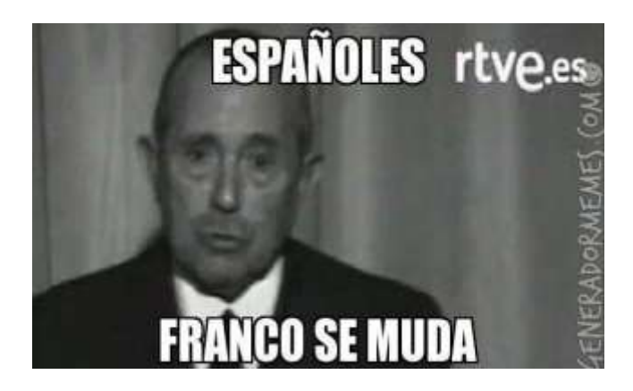
Figure 4. Carlos Arias announces the "move".

In the midst of social tension generated by the dictator's exhumation, irony came in as a player that reinforced the opinion of social groups in favor of removing his corpse from the Valley of the Fallen. Berger (1999) distinguished four types of humour: benign, whose intention is light fun; tragicomic, aimed at mitigating pain and overcoming it; witty, whose aim is to stimulate public's opinion, and therefore more selective; and, finally, satirical, aimed at provoking through mockery and ridicule when there is a difference of opinions or attitudes. We could say that this is the kind of humour that Berger classified as satirical, that is, the one that aims to provoke when disagreements exist.