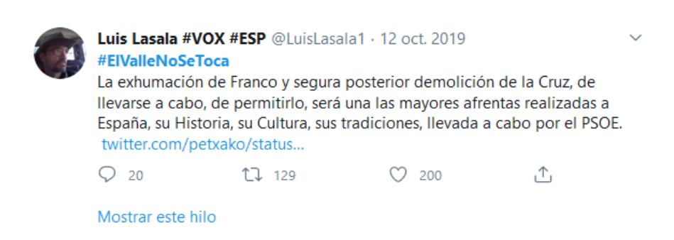
Figure 1. Tweets of the far right against Franco's exhumation

Memorial associations, many groups and individuals were in favour of the decision, justifying it with a necessary democratic measure in 21<sup>st</sup>-century Spain. That is the case of these two tweets written by La Comuna Presss , an association of former political prisoners<sup>5</sup>, and Foro Memoria Madrid [ Forum Memory Madrid ], an organization dependent on the Federación Estatal de Foros por la Memoria (State Federation of Forums for Memory) established with the aim of recovering the historical memory of anti-fascists who fought in the Spanish Civil War, and dedicated to the vindication of memory policies, demanding human rights and universal justice<sup>6</sup>.