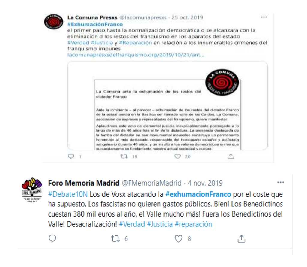
Figure 2. Tweets of memorial associations in favour of Franco's exhumation

The tweets above are an example of the majority of the tweets that spread when news of the exhumation came up. Social movements, political parties and individuals in favour and against expressed their opinion based on several arguments; the latter, linked to right and extreme-right parliamentary groups, argued that it was advisable not to stir up the past and stressed the need not to offend those who are buried, whilst the former, those related to the parliamentary leftwing and memory groups, pledged the urgency to remove the dictator from a public place of worship and to comply with the legislation on memory policies that set forth the prohibition to glorify the symbols of dictatorship. Moreover, they added to those arguments the high cost for the State of preserving the architectural site and the maintenance of the religious order that inhabited the place. Besides, the collective memory also mentioned the fact that the Valley of the Fallen was part of one of numerous spaces built by republican prisoners and, therefore, a traumatic reminder (Sueiro 2006; Rueda & Moreno 2013; Olmeda 2009).