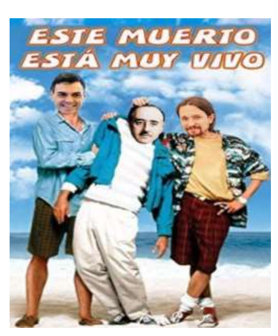
Figure 6. A lively cadaver.

One of the memes that reflected the news items about the exhumation was the following. In it, we can see Prime Minister Pedro Sanchez and Unidas Podemos' leader, Pablo Iglesias, two of the most involved politicians in removing Franco from the Valley of the Fallen, holding the shabby body of the deceased. This meme is based on the poster for Ted Kotcheff's comedy film premiered in 1989 entitled Weekend at Bernie's , which had been translated into Spanish as This corpse is very much alive . The Spanish title made it possible to create a metaphor to compare a body dead for 45 years and the "vitality" of its figure by being current news in 2019. Humour also helped connect with the demands from the memory movement that urged immediate action with regard to the dictator's burial.