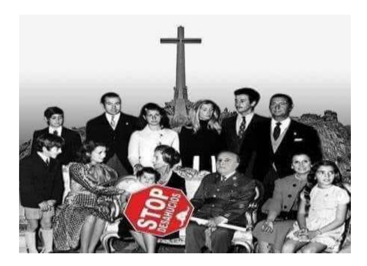
Figure 5. Franco's family and the eviction from the Valley of the Fallen.

One of the memes that reflected the news items about the exhumation was the following. In it, we can see Prime Minister Pedro Sanchez and Unidas Podemos' leader, Pablo Iglesias, two of the most involved politicians in removing Franco from the Valley of the Fallen, holding the shabby body of the deceased. This meme is based on the poster for Ted Kotcheff's comedy film premiered in 1989 entitled Weekend at Bernie's , which had been translated into Spanish as This corpse is very much alive . The Spanish title made it possible to create a metaphor to compare a body dead for 45 years and the "vitality" of its figure by being current news in 2019. Humour also helped connect with the demands from the memory movement that urged immediate action with regard to the dictator's burial.